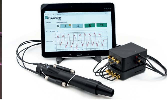
Figure 2: Ultrasound spirometer by Fraunhofer IPMS